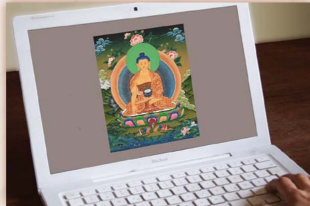
Study from anywhere, at anytime.