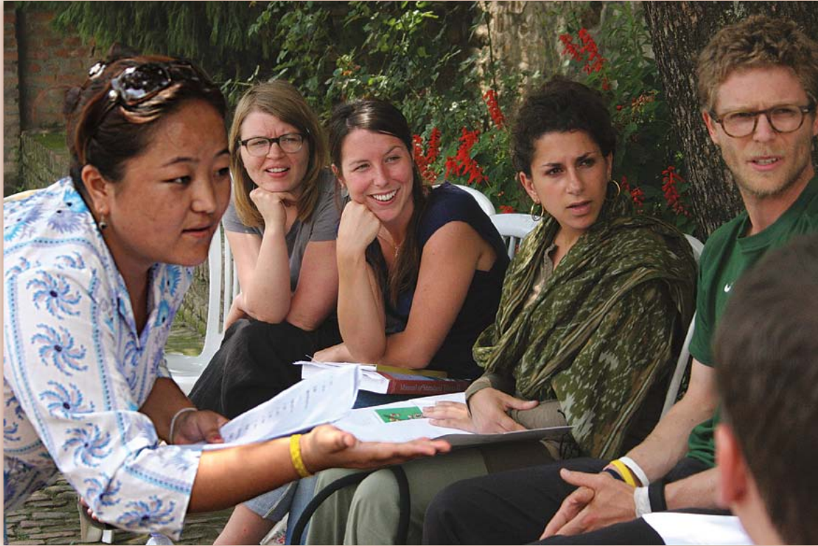
Tibetan instructor drilling conversational Tibetan with RYI students.

Enrollment for the Summer Course 2011 is now open! Our popular language programs in Tibetan, Nepali, and Sanskrit are filling up quickly. Coursework is fun, engaging and takes place in a cultural immersion environment so that optimal learning occurs both inside and outside of the classroom.